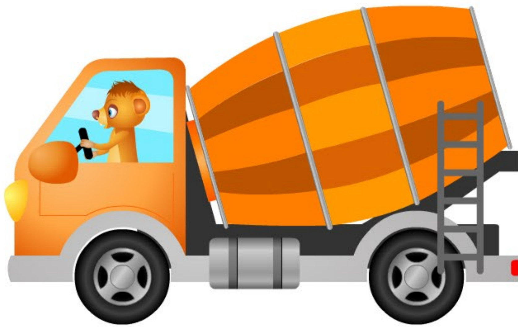
Concrete mixer truck