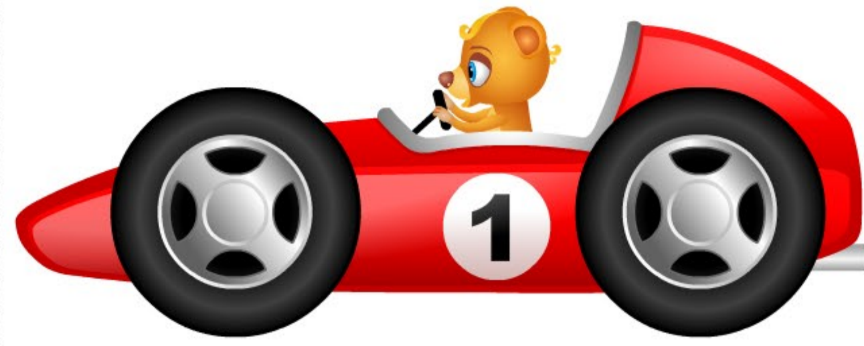
Formula One car